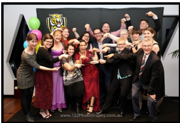
Winners are grinner! At the Deaf Awards Night.