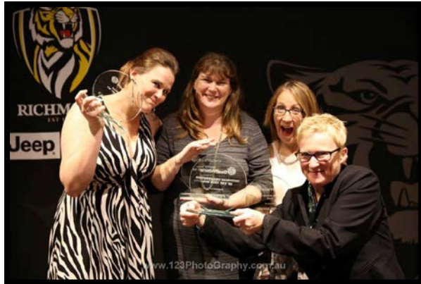
Winners at the Deaf Awards Night.

Hosted by Deaf Victoria and Deaf Sports Recreation Victoria