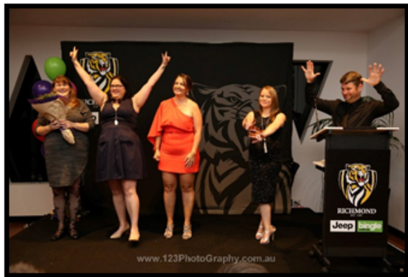
Deaf Awards Night celebrations.